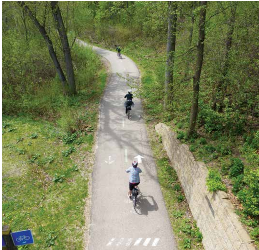
Minneapolis has 85 miles of off-street bikeways and 92 miles of on-street bikeways.

Instead, I popped into another establishment recommended by every cyclist I'd met, Victor's 1959 Café (revolutionary Cuban cooking). It was another chilly, overcast day, providing a contrasted to the explosion of colors and aromas that hit me as soon as I walked into the door. The place was packed, but I found a seat at the counter and lingered over coffee and the Ranchero Cubano (corn tortillas