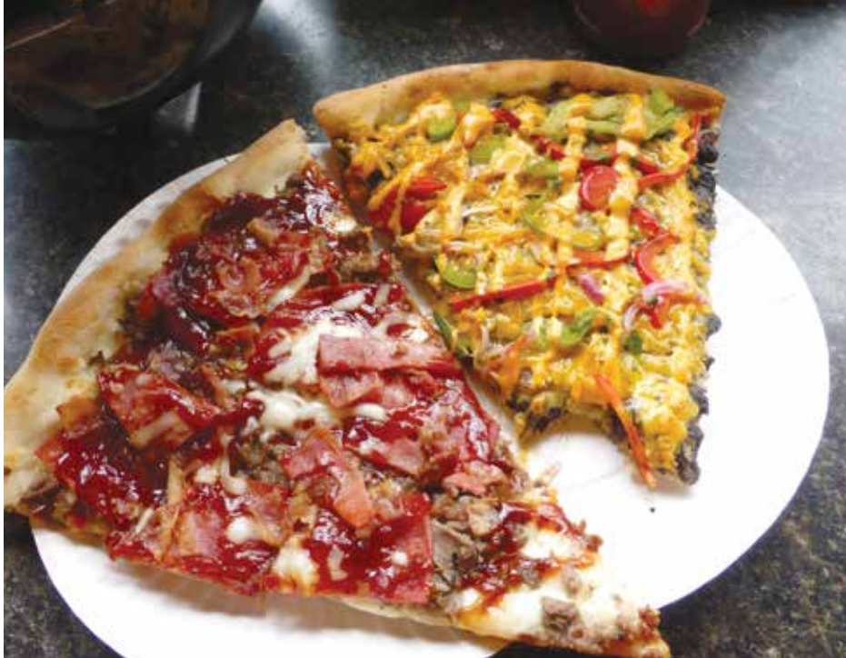
Perfect pedaling fuel at Mesa Pizza by the Slice in Dinkytown near the University of Minnesota.

there were over 200 hosts listed in Minneapolis.