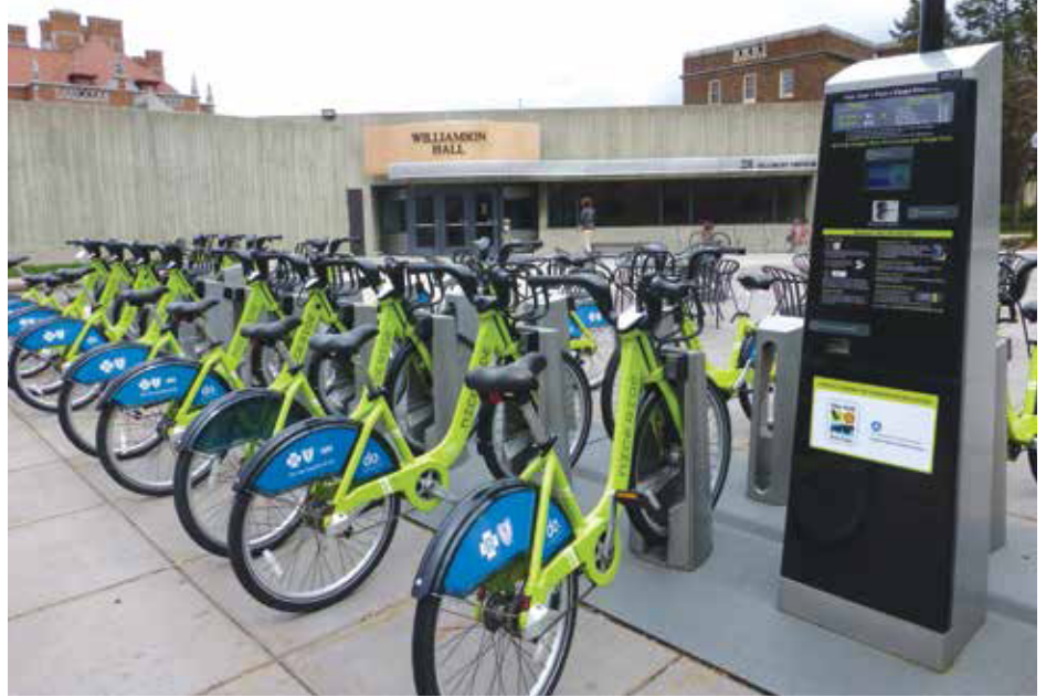
Over 1,500 Nice Ride (bike share) bikes are located in stations throughout Minneapolis and St. Paul.

After spending the week pedaling over 250 miles in and around Minneapolis — and one last visit to my favorite spot on the Stone Arch